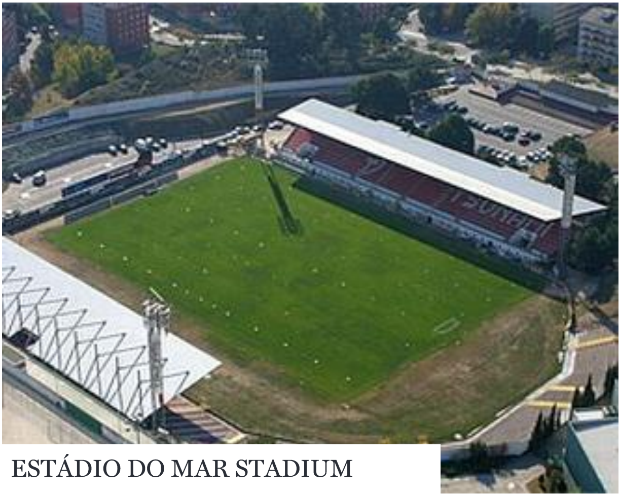
ESTÁDIO DO MAR STADIUM

UNIVERSITY OF PORTO STADIUM Rua das Estrelas, Porto Distance from the Hotel: 4,5 km 13 minutes drive