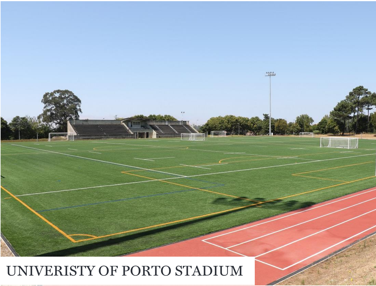
UNIVERISTY OF PORTO STADIUM

CCD PORTO Rua Alves Redol, 292, Porto Distance from the Hotel: 500 meters 2 minutes drive