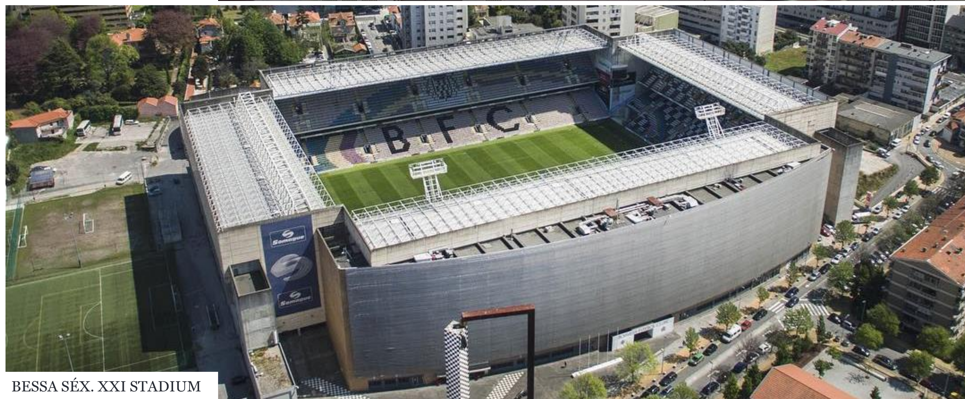
BESSA SÉX. XXI STADIUM