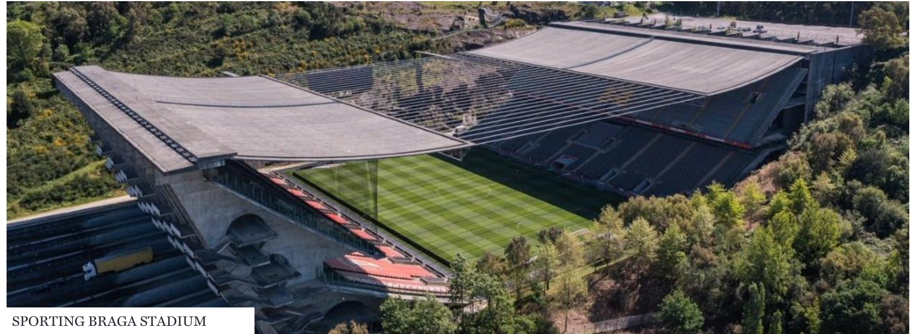
SPORTING BRAGA STADIUM